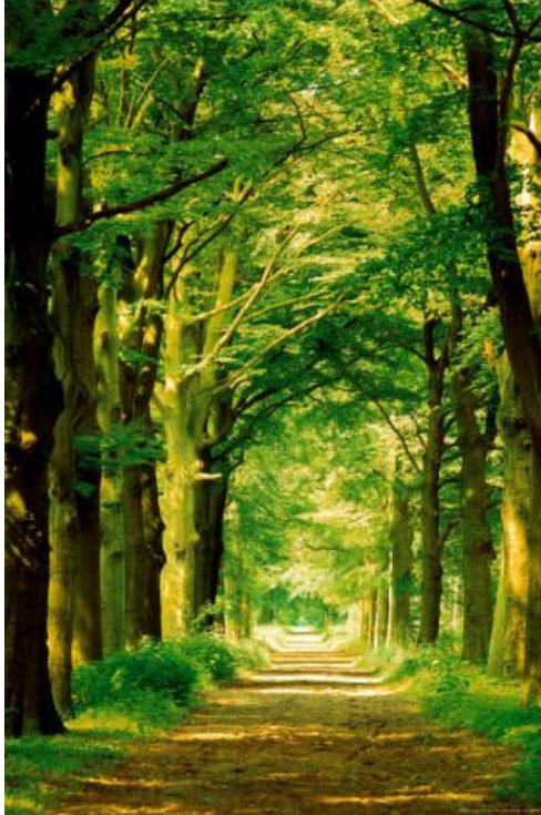
Pathway through Silvantri <above> Entrance to area "D" <below>