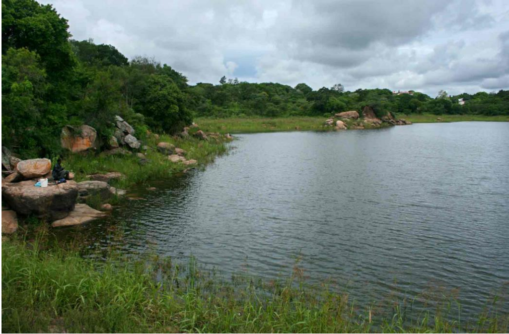
Unicorn Lake Area "F" <above> and Springwood fauna <below>